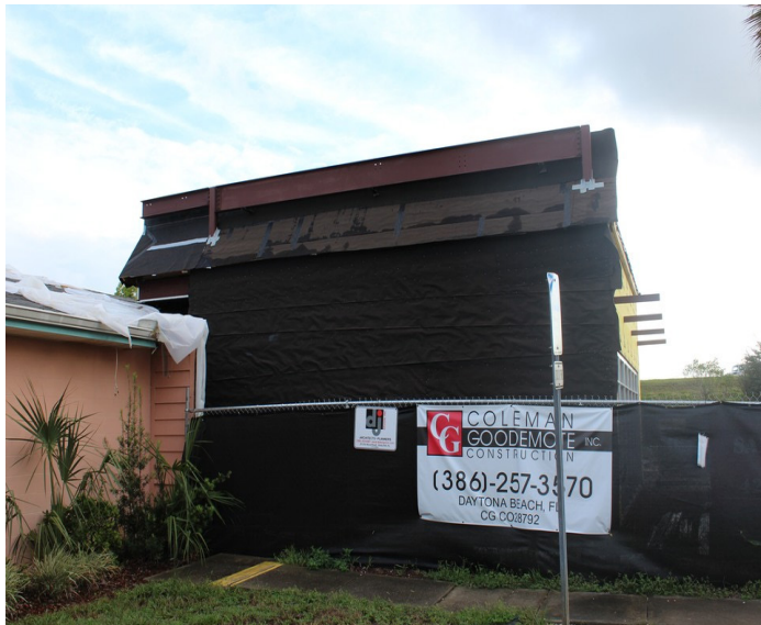
The second story elevation is in place as the construction moves right along on the east side of the main campus facility.