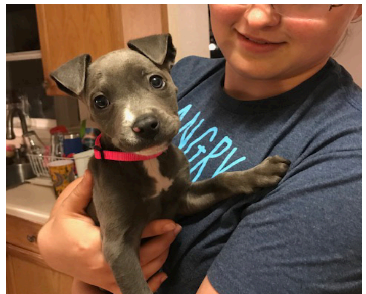
River feeling much better.