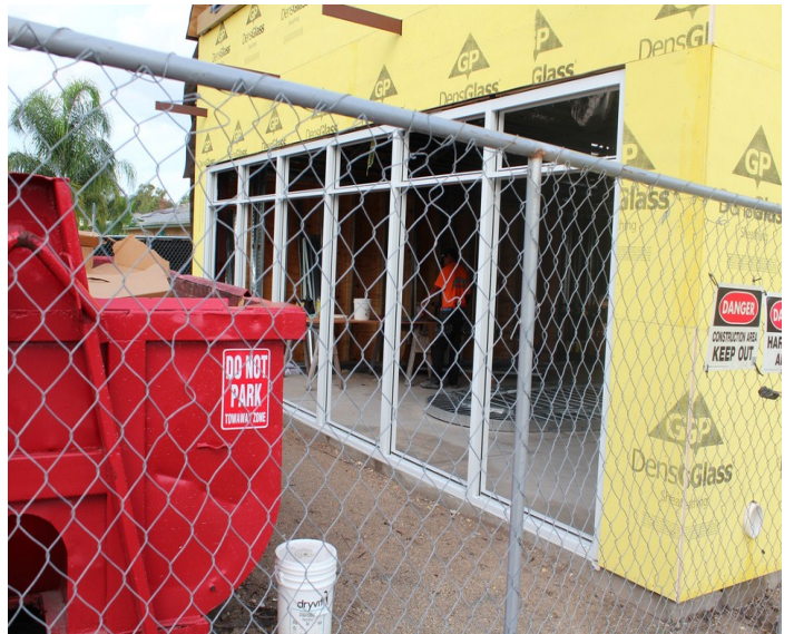
The front window frames are in place and ready for glass in the admissions area.